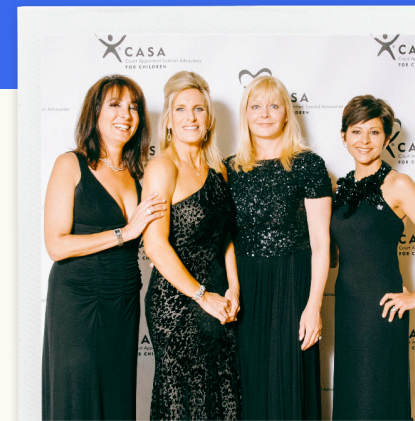
CASA CELEBRATION 2012 Chairholders